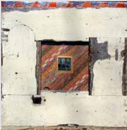
KAVANAGH HIMSELF 2007