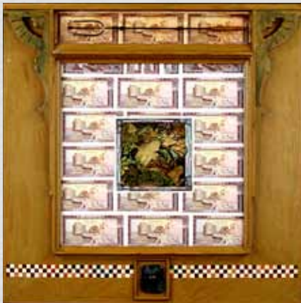
PLAGUE OF THE FROGS 1990