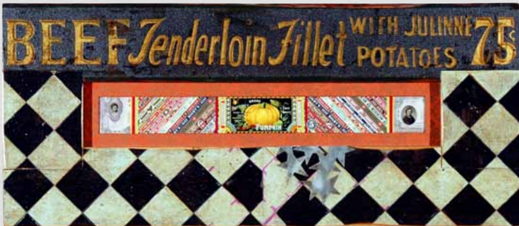
MY IMAGINARY BROTHERS' PUB 2005