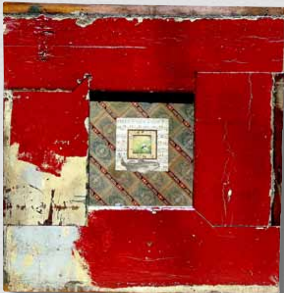
JAKE'S DOG SCRAPPY 2007

JC: There are a total of sixteen pieces in the series, which I created in 2002 and titled Animalloys. They were inspired by a collection of English cigarette premiums from the 1930's that I purchased on eBay, where I find a lot of my material. Three premium cards make up a complete animal. I started playing with them and instead of putting three together to make an alligator, for instance, I began to shuffle them up to make unusual animals. Then I read on the back of the cards, "By mixing the sections you can produce a large number of strange creatures with amusing names." How clever!