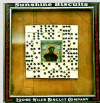
THE GAMBLER 1995