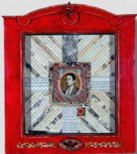
THE MURDERER 2002

Jim Collins : It works both ways. In either case, the material has to have some quality to draw my attention. Primarily it's color or design if it's something like a stack of labels.